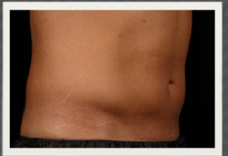
Before & 12 weeks after 2 nd SculpSure series Areas Treated: Upper & lower abdomen, left & right love handles